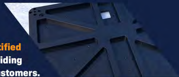
Anodize Type 3 - Black

We are ISO9001:2015 Certified and are committed to providing the highest value to our customers.