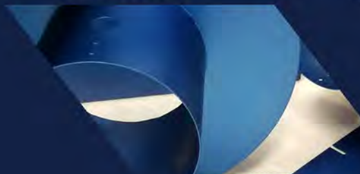
Anodize Type 2 - Blue